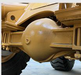
Heavier Type Axle