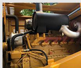
Mutiple Seletion Of Engine To Meet Different Emission Standard