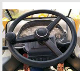
Fully Function Panel